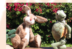
Jack Rabbit & the Desert Tortoise