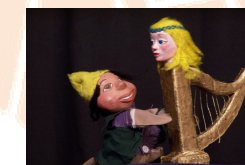
Jack and the Beanstalk

Aug 23-Sept 17 Meet Baby Bear and his friends on their very first day of school. A back to school tradition. Preschool and up.